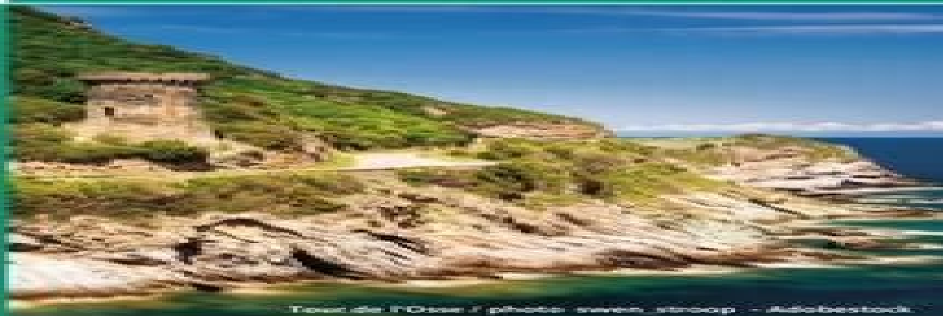
Tour de l'Osse