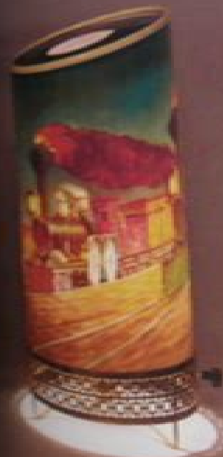
Trains Racing 1957 LA Goodman Chicago, IL 17" Plastic 825 - 845