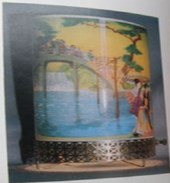
Oriental Fantasy 1957 LA Goodman Chicago, IL 17" Plastic