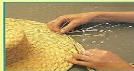
Sewing and Finishing Tips