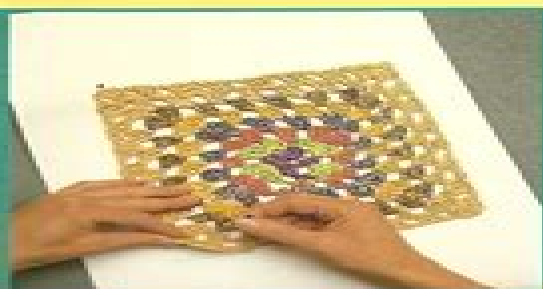
Easy to Make Patterns