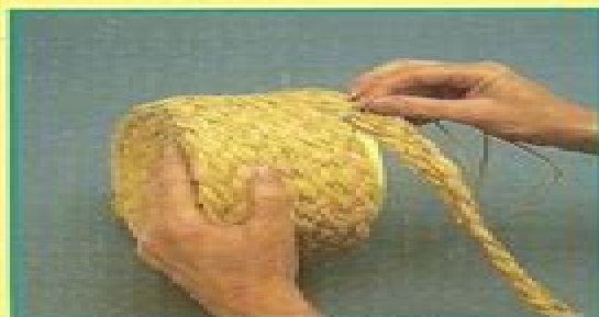
Hat Making Techniques