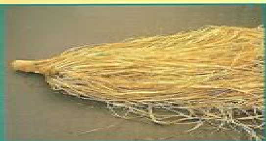
Handling the Raw Raffia

Learn everything you need to know about working with Raffia! From the basic first steps needed to get started, right through to 8 easy-to-follow projects.