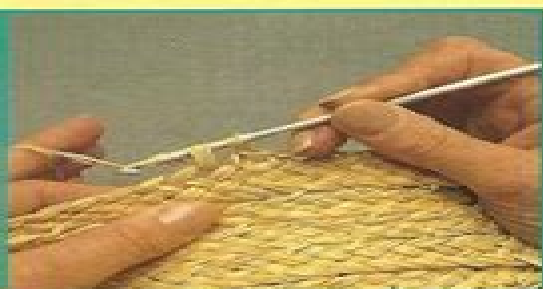
How to Crochet the Raffia