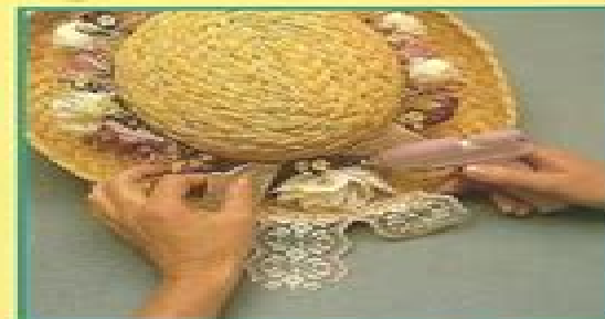
Decorating your Hat