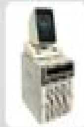
1977 APPLE II