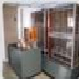
1973 XEROX ALTO