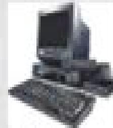
1982 COMMODORE AMIGA CDTV