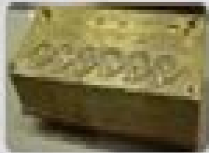
1645 MACHINE À CALCULER

CLIQUE SUR LES +INFO POUR AVOIR PLUS D'INFORMATIONS.