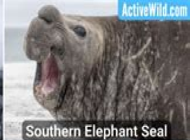
Southern Elephant Seal