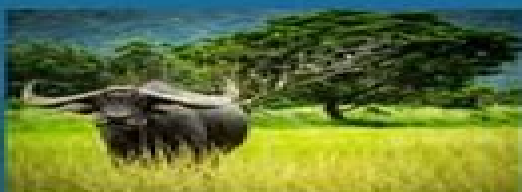
5. Water Buffalos