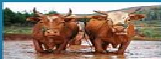
2. BULLS (OXEN)