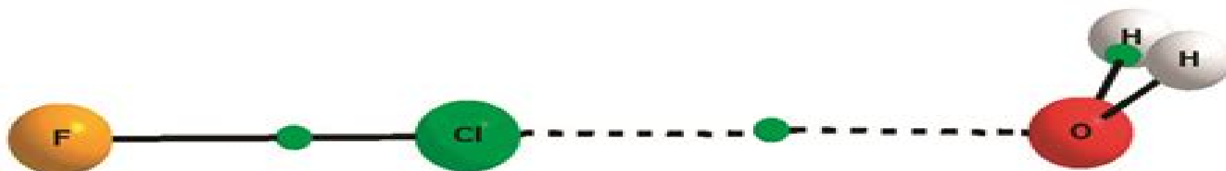
F-Cl ... O "Halogen bond"