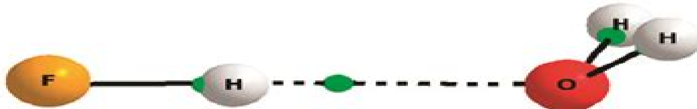
F-H ... O "Hydrogen bond"