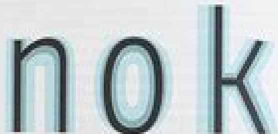
Fig. 100. It is not so easy for a typeface to make an increase in weight on the outside side of letters. The result that appears problems in the context should appear consistent, any more than the rest of the characters will, such as in this example.

It is recommended that the thickness of strokes given in such a way that the resulting font does not become awkward in its horizontal proportions. In this sense, and where possible, it is advisable to increase the inner weight in the interior of the glyphs than on the outside. In this way, it is possible to avoid compound lines of text becoming too long, and the letters give volume without disturbing their underlying structure. The proportions of each glyph's definition are not modified through