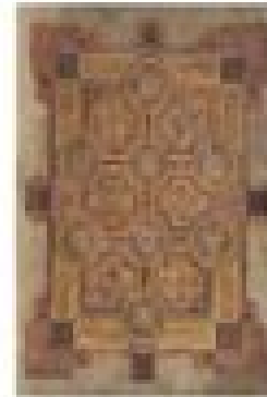
Opposite: The double-armed cross (E, vi) – normally the opening page of the Book of Durrow