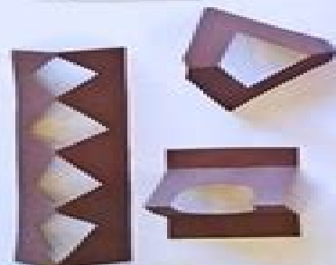
fold & cut