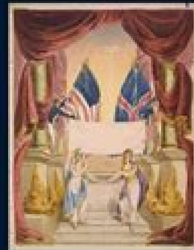
Top: Symbolic Representation of the Treaty of Ghent