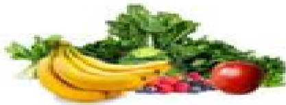
Fruits and Vegetables