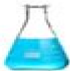
Preservatives and Artificial Flavors