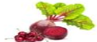
Cherries and Beets