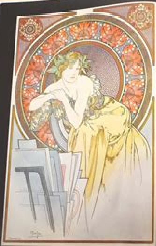
177. FERNÉ DE L'ART NOUVEAU (1890-1900) (1890-1900)