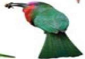
Red-bearded Bee Eater