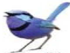
Splendid Fairy Wren