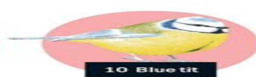
10 Blue tit