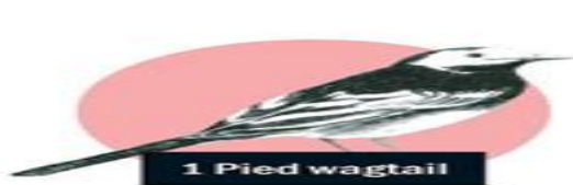
1 Pied wagtail