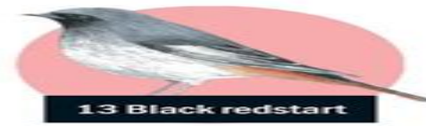
13 Black redstart