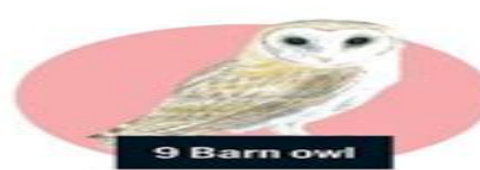
9 Barn owl