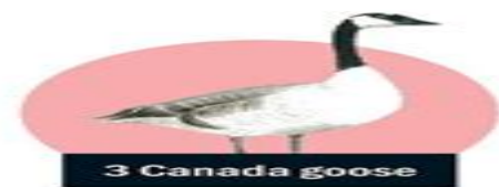
3 Canada goose