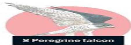
8 Peregrine falcon