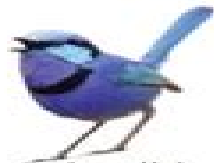
Splendid Fairy Wren