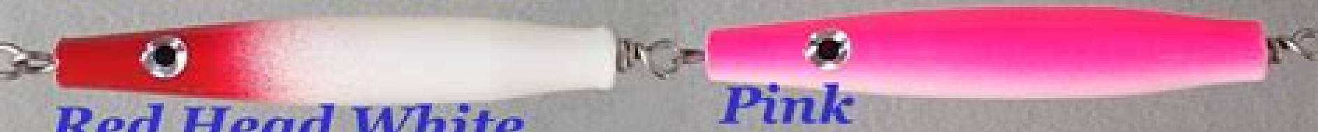
Red Head White