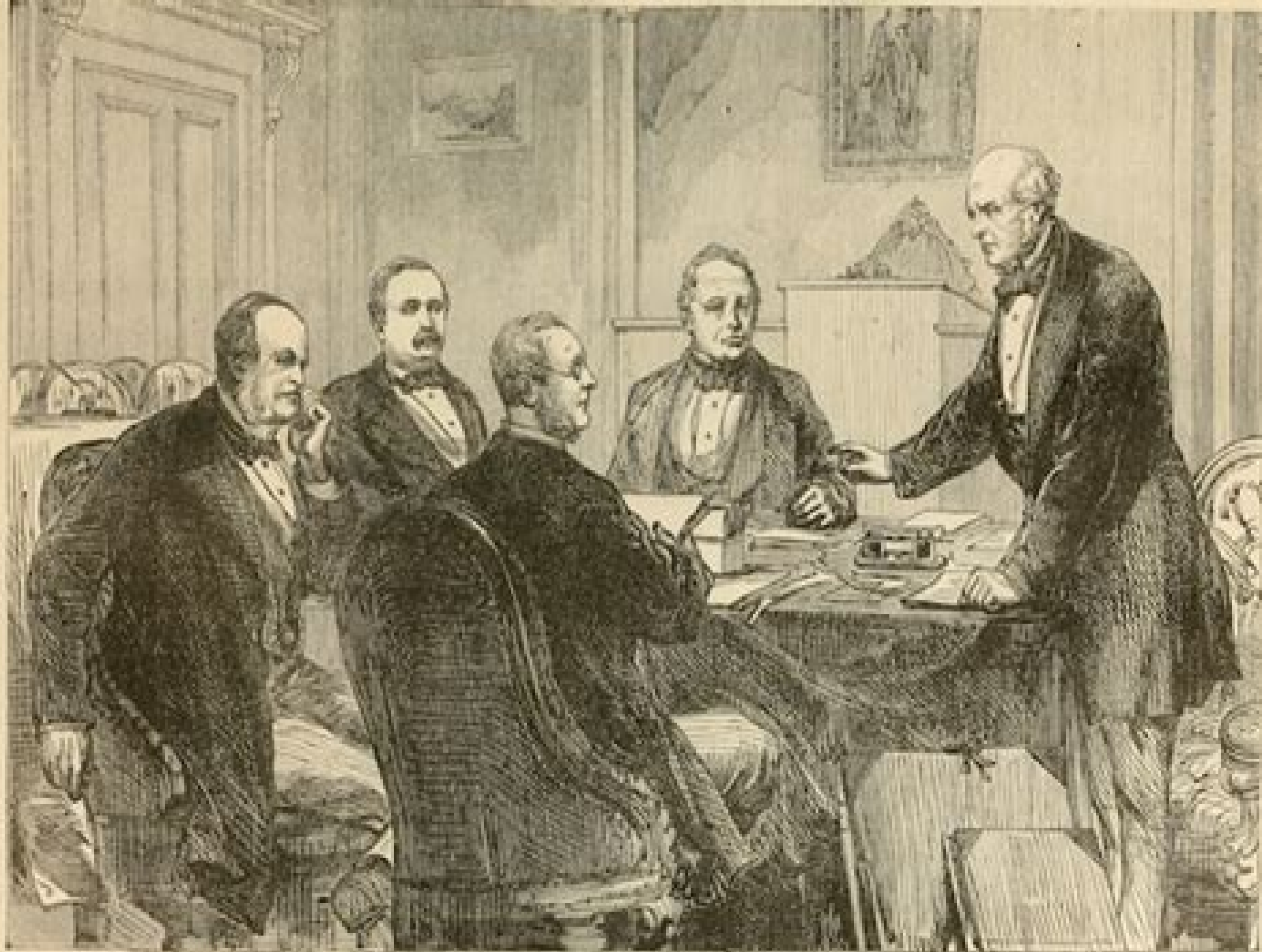
THE GENEVA BOARD OF ARBITRATION "SETTLING THE ALABAMA CLAIMS."