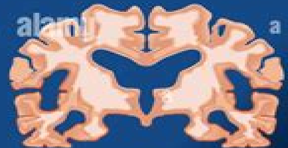
Severe Alzheimer's Disease