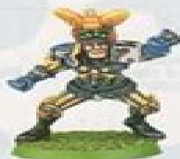
Griff Oberwald 099900701