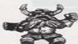
Deathroller Driver 099901901