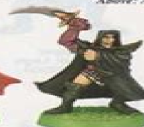
Horkon Heartripper 099901601