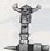
Deathroller Gear Stick 099901906