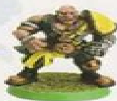
Mighty Zug 099901301