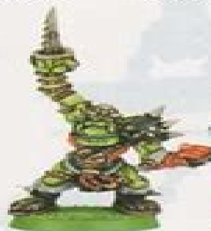
Varag Ghoul-Chewer 099901401