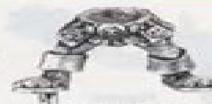
Morg N Thorg Legs 099900803