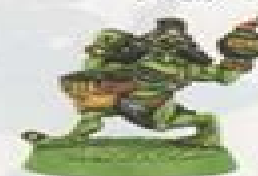
Bomber Dribblesnot 099902201