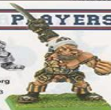
Above: A complete Morg N Thorg