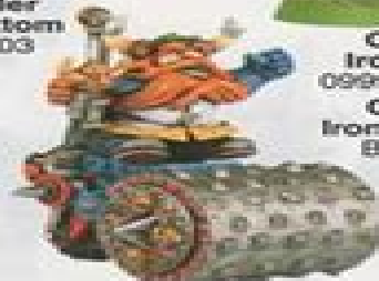
Dwarf Deathroller (Complete) (1) B 093