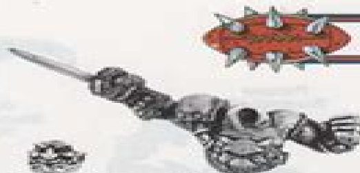
Morg N Thorg Torso 099900802