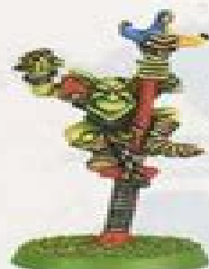
Scrappa Sorehead 099900601 Scrappa Sorehead (1) B 112