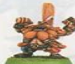
Grim Ironjaw 099901801