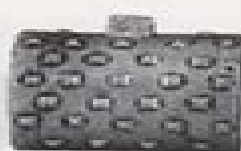
Deathroller Wheel Bottom 099901903