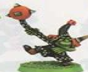
Fungus the Loon 099902101