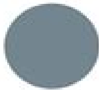
Behr Adirondack Blue