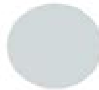
Benjamin Moore Blue Lace