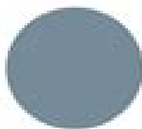
Sherwin-Williams Bracing Blue