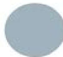
Sherwin-Williams Dockside Blue