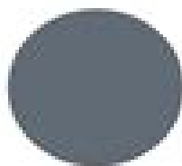
Sherwin-Williams Granite Peak