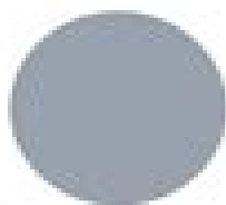
Benjamin Moore Comet