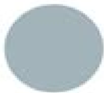
Benjamin Moore Santorini Blue