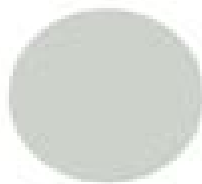
Sherwin-Williams Sea Salt