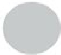
Sherwin-Williams Gray Screen