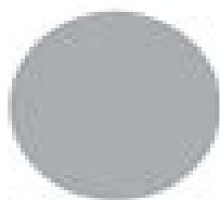
Sherwin-Williams Morning Fog