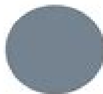
Benjamin Moore Bachelor Blue