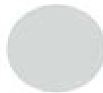
Sherwin-Williams Olympus White