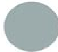
Valspar Blue Arrow