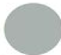
Benjamin Moore Boothbay Gray