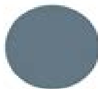
Benjamin Moore Stillwater