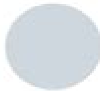
Benjamin Moore Beacon Gray