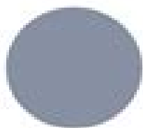
Benjamin Moore Flower Box