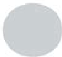
Sherwin-Williams North Star