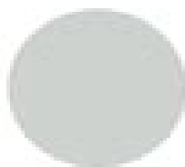
Benjamin Moore Sterling