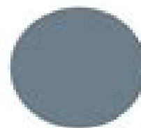
Benjamin Moore Normandy