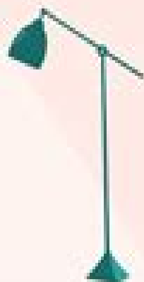
SWING ARM LAMP