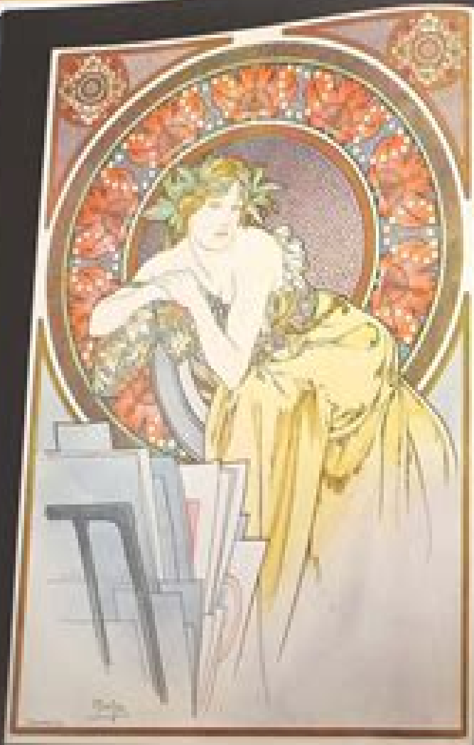
177. FERNÉ DE L'ARTISTE À DÉCOUVER PAR M. DE L'ARTISTE, 1900