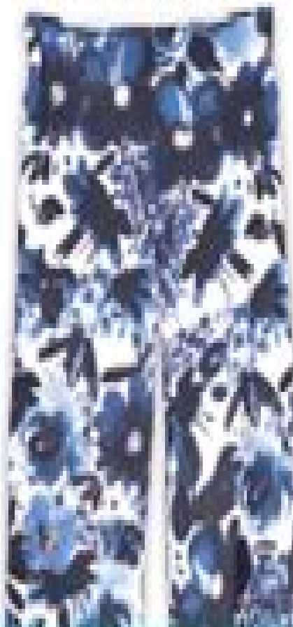
Magic Pants (no waistband, no zipper)