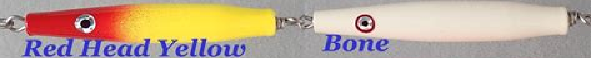
Red Head Yellow