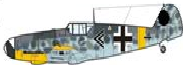
BF 109G-5, Gerhard Barkhorn, II./JG 52, Eastern Front, November 1943