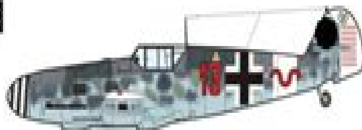
BF 109G-6/R6, Heinrich Bartels, 11./JG 27, Luftwaffe, Kalamaki airfield, Greece, November 1943