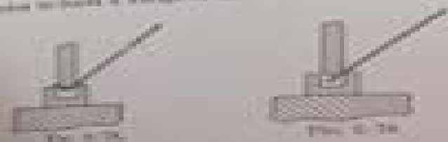
Figure 6-21 shows clearly why there are limitations in the length of flange that can be formed. If the separation of the surface has within a range of insufficient height, the condition

in the section 40. Figure 6-20 shows the part finished up with.