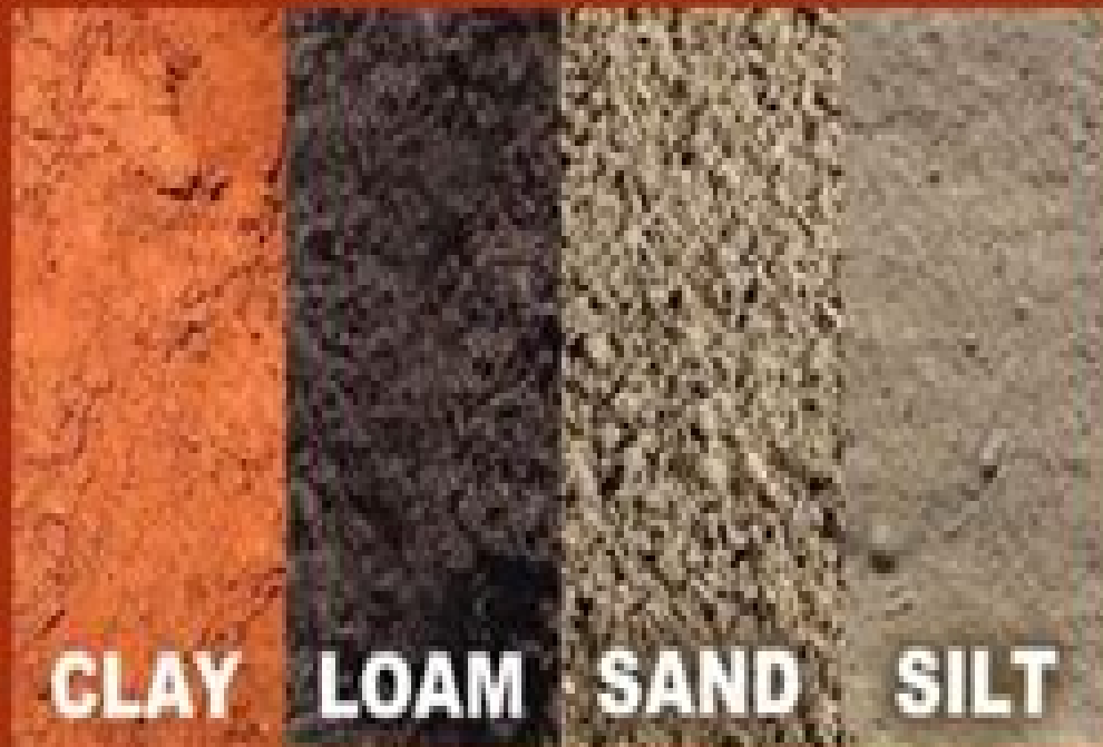
Types of Soil - Clay, Loam, Sand and Silt