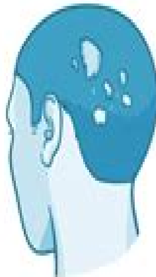
HAIR & SCALP