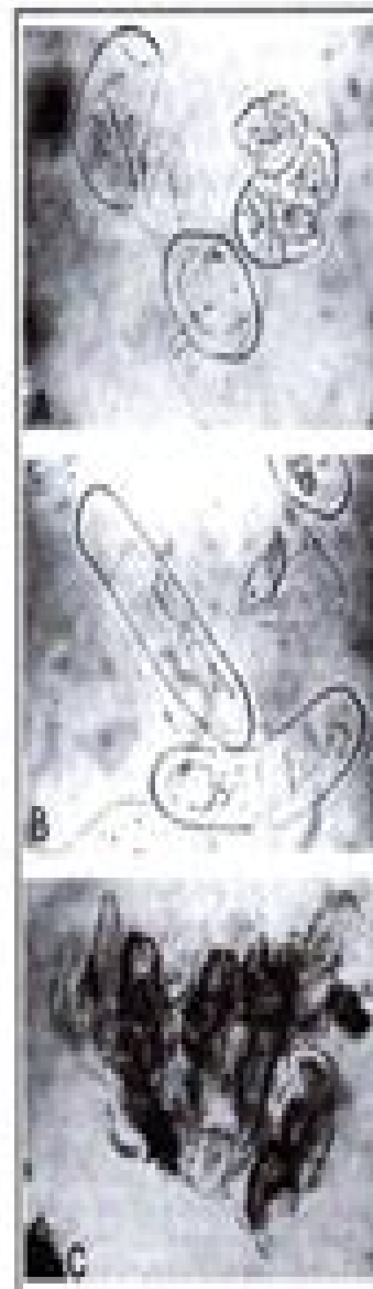
5 Fig 61

Showing morphological and histological changes in the cells of xylem tissue during cytodifferentiation. Rounded and oval cells of the xylem tissue up to 3 passages (A), elongated cells with thick wall (B) after 5 passages, and xylem tissue after 8 passages of culture (C)