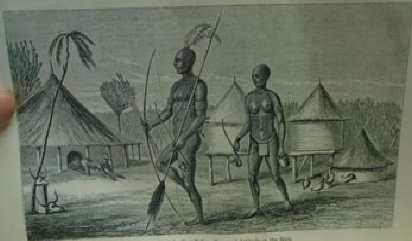
A Homestead of the East Tellewally near Attende in the Moss.

... has been described in its own suspended in the top of the pole is a large feathered. Every man stands, the whole of his legs when women are the feet stick, lips and the pro- pel, and the usually has grey blood. They are a broad back, no closely rubbed with red ochre. This pigment is made of iron, which, they and then formed in both sexes about the into a paste by the themselves the appear- hair upon their pro- of the head, in with others. The women their heads being done set, about six inches long, wigs, worked like a net and the metal tail of the from indignant hair and tail are done and the hair, like the and the completed in the is completely set the only set in which are women which are women all: the girls are then of, generally the hair quickly, but in a in a at