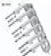
3 phase AC produced in a power station