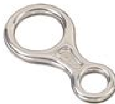
Descender (figure of 8)