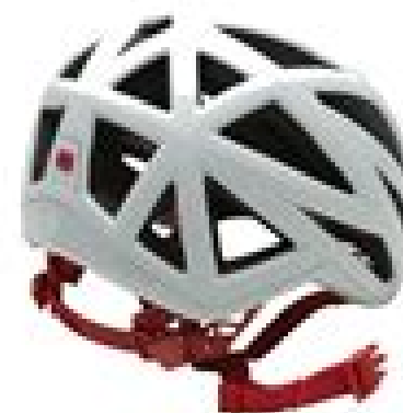
Helmet - UIAA tested