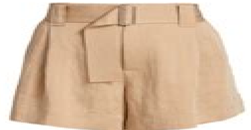
10. DRESSY SHORTS