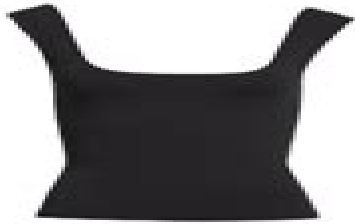
1. BASIC TOPS