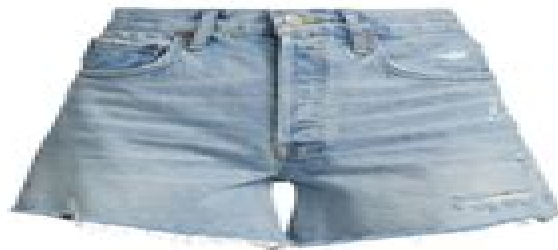
9. CASUAL SHORTS