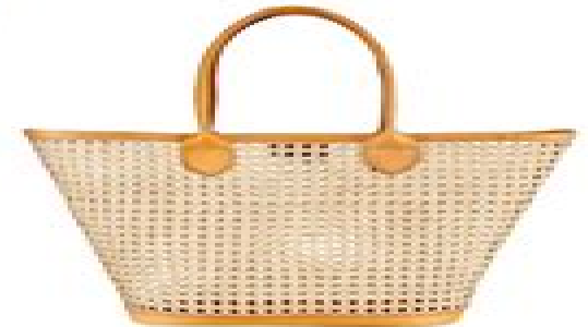
7. WOVEN TOTE