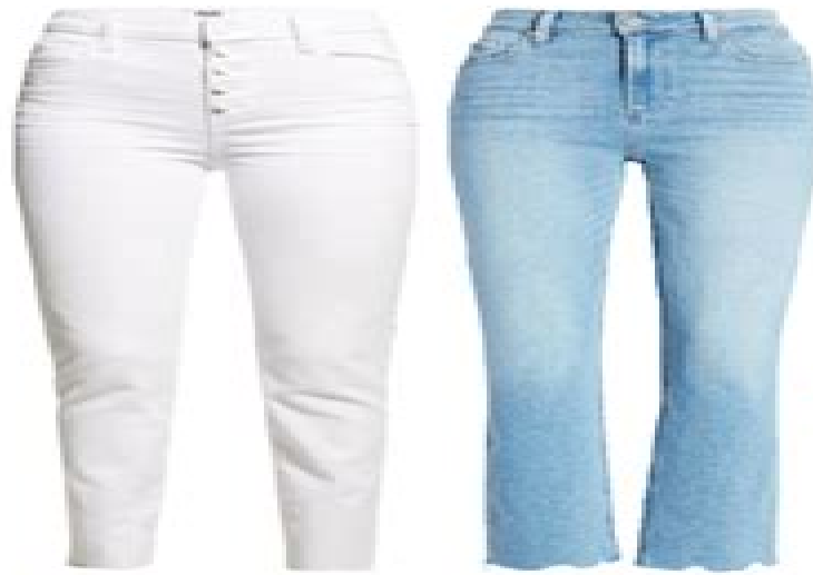
5. SUMMER DENIM