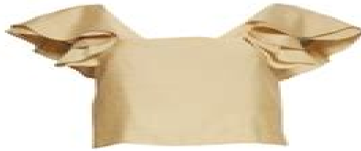
2. DRESSY TOPS