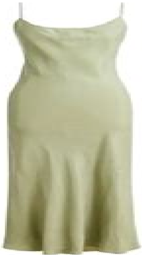
4. VERSATILE DRESS