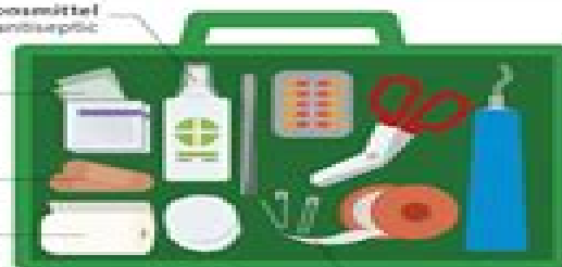
das Heftpflaster adhesive tape