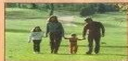
שבת שלש חגלים שמע תפילה תקון תשובה