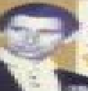
Dr. [Name] [Title]