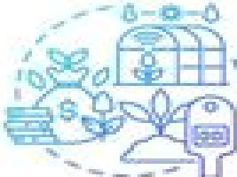
SPENDING ON CLIMATE