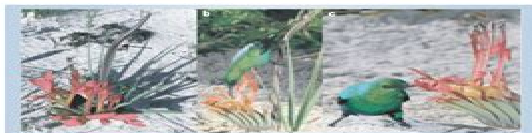
Figure 1 Features of the South African plant Babiana rigens . a , The specialized bird perch (arrow) and ground-based flowers of B. rigens . b, c , Male sunbirds ( Nectarinia famosa ) visiting the plant adopt different positions to feed according to whether the perch is b , present, or c , absent.

Although perch removal did not preclude visitation by sunbirds (Fig. 1c), they preferred plants with intact perches. Of 93 visits recorded after perches were removed from half the plants, 59 were made to plants with perches and 34 were made to plants without perches ( G = 6.80 , P = 0.009 ). Female and male birds showed different preferences for