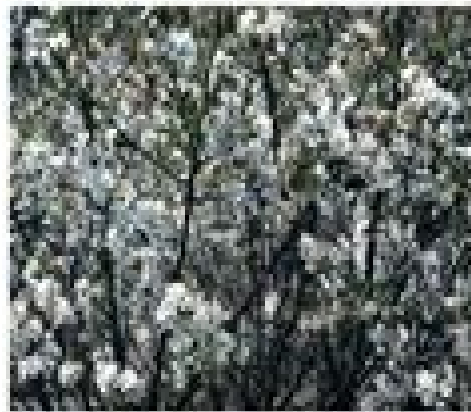
flower: apple blossom