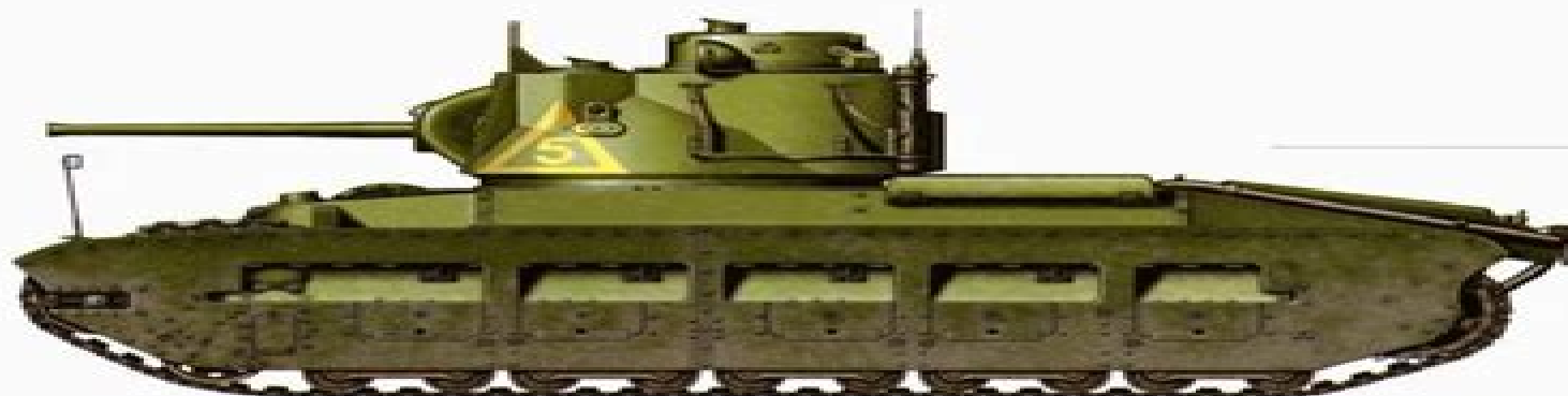
Infantry Tank Mk II „Matilda” II z nieustalonej jednostki kanadyjskiej, Wielka Brytania, 1942 rok. Infantry Tank Mk II "Matilda" Mk II tank from unidentified Canadian Army unit, Britain, 1942.