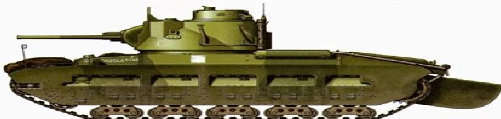
Czołg piechoty Mark II „Matilda” II „Gorgonzola” z 7. RTR 1. Brygada Czołgów Armii, Arras, Francja, maj 1940 roku. Infantry Tank Mark II "Matilda" II nicknamed "Gorgonzola" from the 7th RTR 1st Army Tank Brigade, Arras, France, May 1940.