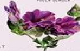
DESERT FOUR O'CLOCK MIRABILIS MULTIFLORA