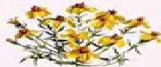
ROCKY MOUNTAIN ZINNIA ZINNIA GRANDIFLORA