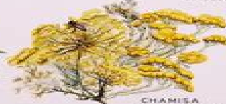
CHAMISA ENCELIA CALIFORNICA