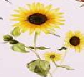
WILD SUNFLOWER HELIANTHUS ANNUUS