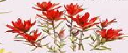
WHOLELEAF INDIAN PAINTBRUSH CASTILLEJA INTEGRATA