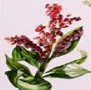
WILD RHUBARB RHUS MICROCARPA