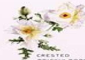
CRESTED PRICKLY POPPY ARGEMONE POLYANTHEMIS