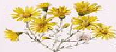
LACY TANSY-ASTER ASTEROTOMA STYLULOSA