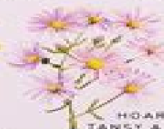
HOARY TANSY ASTER DIMERIA CUNEOLATA