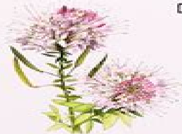
ROCKY MOUNTAIN BEEPLANT CLEOME SERRULATA