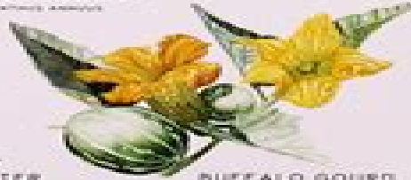
BUFFALO GOURD CUCURBITA FOETIDISSIMA