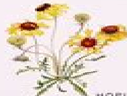
HOPÍ BLANKETFLOWER GAILLARDIA TOMENTOSA