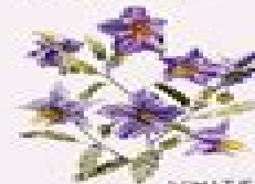
WHITE HORSENETTLE SOLANUM ELAEAGNIIFOLIUM