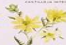
ADONIS BLAZINGSTAR MONTICOLA MULTIFLORA