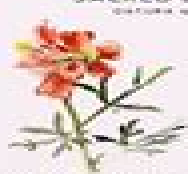
COWBOY'S DELIGHT SPHAERALCEA OCCIDENTALIS