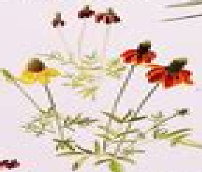
MEXICAN HAT CONEFLOWER RATIBIDA COLUMNIFERA