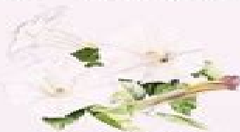
SACRED DATURA DATURA INNOXIA