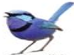
Splendid Fairy Wren