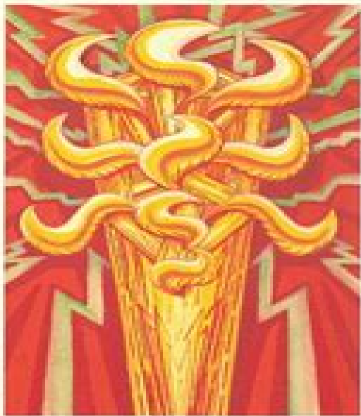
Ace of Wands