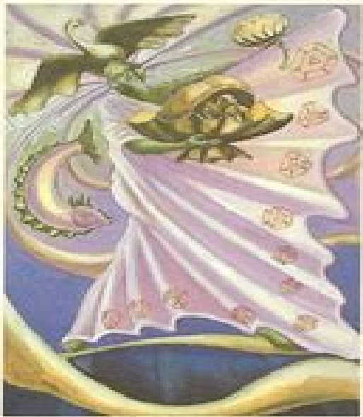
Princess of Cups