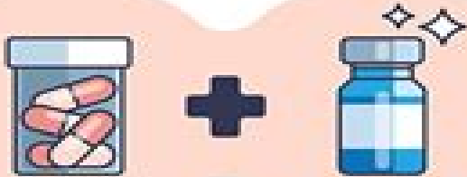
DRUG - DRUG INTERACTION