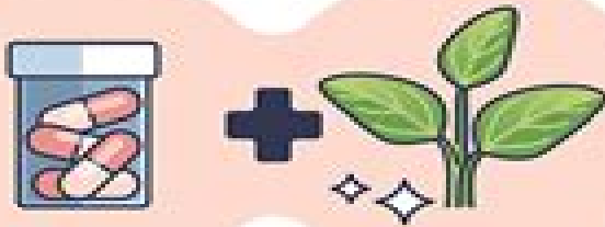
DRUG - HERB INTERACTION