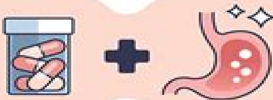
DRUG - ALLERGY INTERACTION