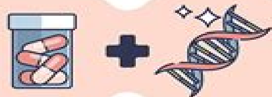
DRUG - GENE INTERACTION