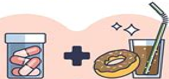
DRUG - FOOD INTERACTION