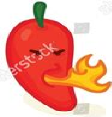
hot / spicy chili