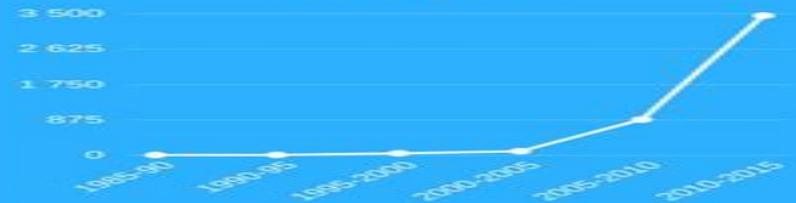
Science publications on anti-aging

Some treatments are already available to the most determined and with enough efforts from all the actors in the field, the slow decline of age can one day become no more than a distant memory.