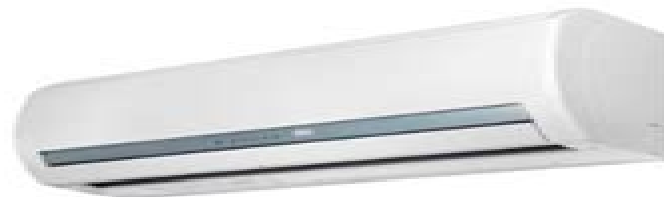
Ductless Air Conditioner