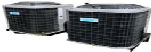
Dual Fuel AC