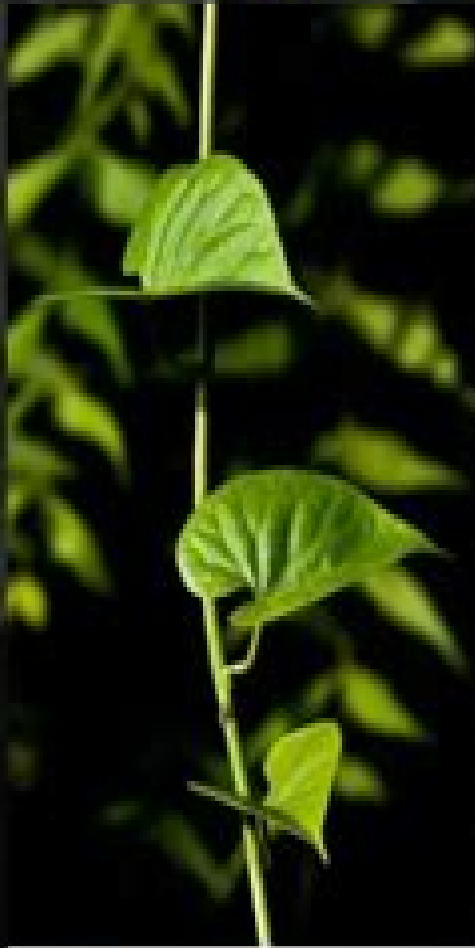
Reduced Photosynthesis and Growth