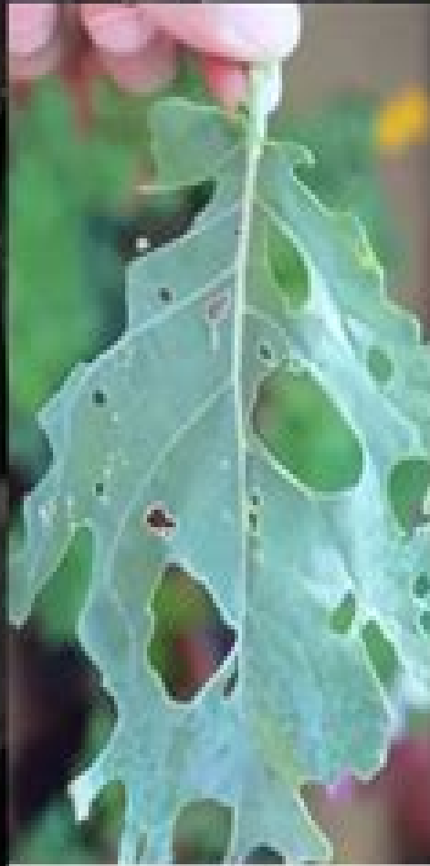
Damage to Leaf Structure and Function