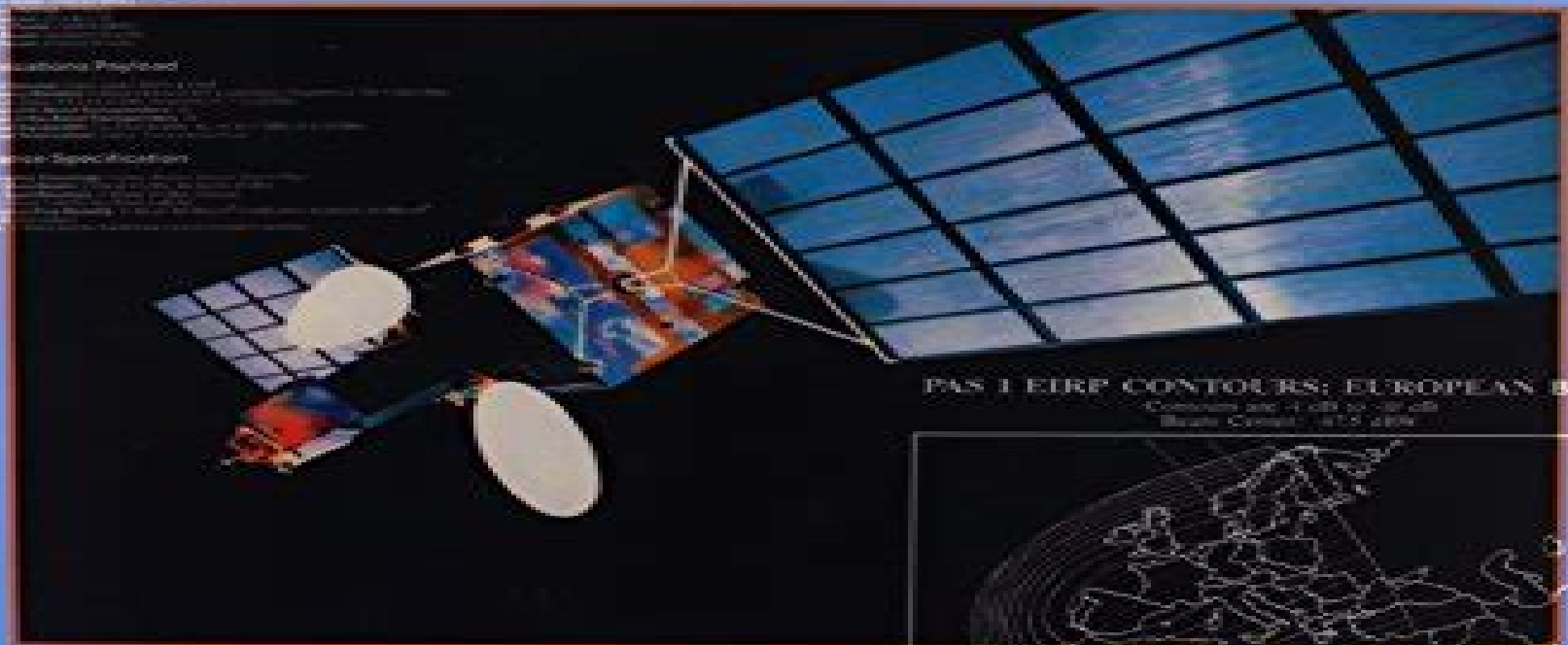
PAS 1 ERP CONTOURS: EUROPEAN BEAM

Performance Specification Performance Specification Performance Specification Performance Specification Performance Specification